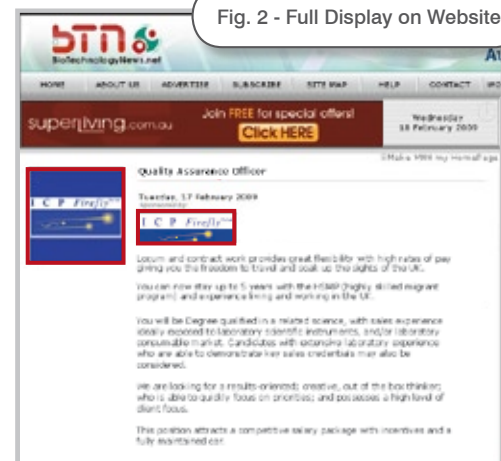
Fig. 2 - Full Display on Website